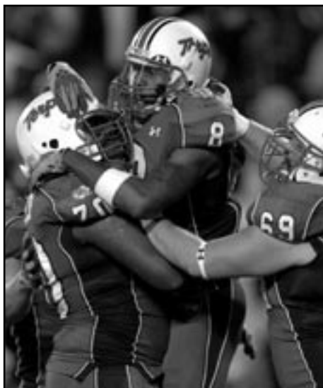
Maryland celebrates Darius Heyward-Bey's 46-yard touchdown reception.