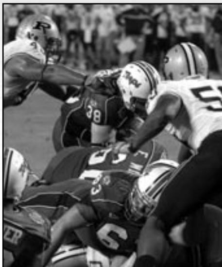
Cory Jackson scores to give the Terps a 14-0 lead in the second quarter.

ATT - WEATHER - 69 degrees, cloudy, 5 mph E wind